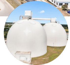
The new DomeSilo is the second at the site; the first was built in 2017.