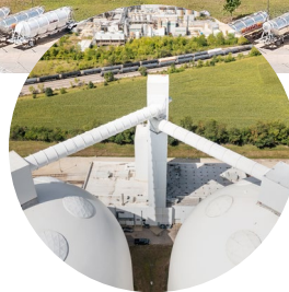
The large tube gallery connects the existing bucket elevator to the new DomeSilo.