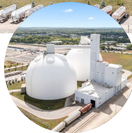
Rail is essential for both receiving and loadout at the distribution facility.