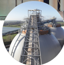
The exterior of the watertight DomeSilos is ideal for the preservation of wood pellets.